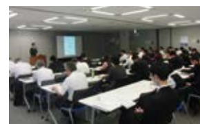
Sales unit training

Divisions responsible for legal affairs conduct job-specific training that features items for consideration in practical business situations. In fiscal 2016, classroom-based training was conducted mainly for the sales and administrative unit personnel (2,372 in total) of domestic and overseas companies covering a variety of themes, including antimonopoly laws. Furthermore, we conducted e-learning programs for employees at all bases, including those overseas.