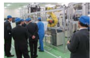
Inspection taking place at the Suzuka Factory

In fiscal 2016, the rates of attendance of Outside Officers at meetings of the Board of Directors (which were held 13 times) and meetings of the Board of Auditors (which were held 10 times) were 98% and 95%, respectively.