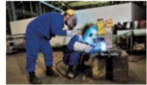
Transfer of skills in Suzuka factory

* Held jointly by the Ministry of Health, Labour and Welfare, the Japan Vocational Ability Development Association, and ZENGIREN, this competition lets seasoned engineers put their skills to the test to determine who is the best in Japan. With no age restriction, the level of competition in this event is higher than in the National Skills Competition, which is generally only open to people ages 23 and under.