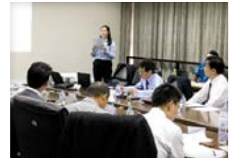
Procurement training at a production base in China