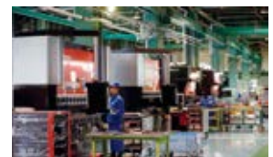
Kobe Factory at which all processes from sheet metal processing to shipment are handled

establishing a system in which all processes, from sheet metal processing to shipment, are handled within the factory. As a result, we are now poised to provide more flexible responses to customer needs.