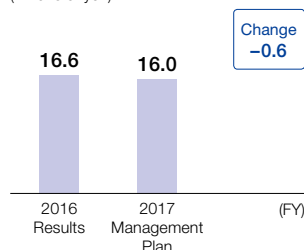
Net Sales in Europe (Billions of yen)