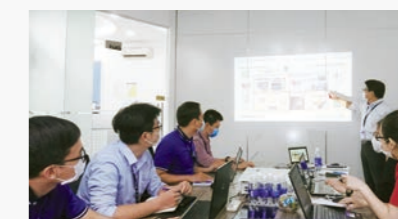
Fuji CAC sales staff and engineers participating in product study sessions for industrial plants

* Fuji Electric Asia Pacific Pte. Ltd., Fuji Electric (Thailand) Co., Ltd., Fuji Electric Vietnam Co., Ltd., PT Fuji Electric Indonesia, Fuji CAC Joint Stock Company, Fuji Electric Sales Malaysia Sdn. Bhd., Fuji Electric Sales Philippines Inc.