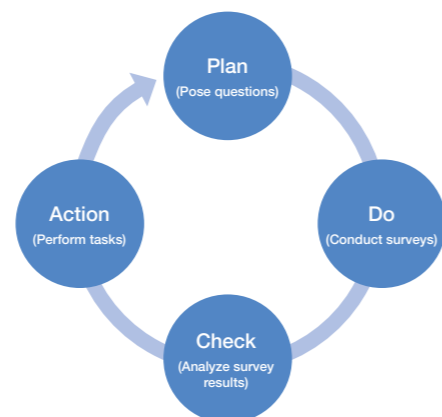
PDCA Cycle for Understanding Employee Awareness

through a training system for line managers to refresh their understanding of the line manager's role and necessary skills and expertise through group training sessions and e-learning repeated once every two years.