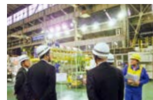
Tour of Chiba Factory

to deepen their understanding of Fuji Electric's management. In fiscal 2018, a business site inspection took place at Chiba Factory. Outside Officers were given explanations of the factory after which they toured the actual production floors and engaged in discussions with factory managers.