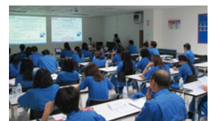
Training at an overseas base

Divisions responsible for legal affairs conduct job-specific training that features items for consideration in practical business situations. In fiscal 2017, classroom-based training was conducted mainly for the sales and administrative unit personnel of domestic and overseas companies covering a variety of themes, including antimonopoly laws and the prevention of corruption. Furthermore, we conducted e-learning programs for employees at all bases, including those overseas.