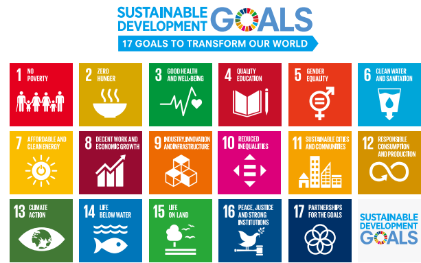
Sustainable Development Goals

As a compass for the promotion of CSR, we have established the Fuji Electric Code of Conduct, a set of six principles for guiding concerted action based on a shared understanding between the Company and all of its employees. In addition, Fuji Electric has defined key environmental, social, and governance (ESG) issues in reflection of the Ten Principles of the United Nations Global Compact, which are arranged around four areas. Initiatives for addressing these issues are underway. Through its business, Fuji Electric endeavors to contribute to the achievement of the United Nations Sustainable Development Goals, which were adopted by the UN General Assembly in September 2015, and is thereby striving to help realize a sustainable society.