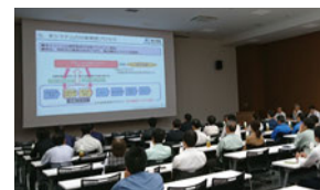
Global estimate management system explanatory forum for business partners