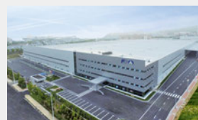
Second DFB factory

A second factory was constructed at Dalian Fuji Bingshan Vending Machine Co., Ltd. (DFB), in order to improve our vending machine production capacity in China. We introduced the integrated production line technologies at use in Mie Factory into the second Dalian factory and also installed cutting-edge automation and IoT equipment to improve productivity.