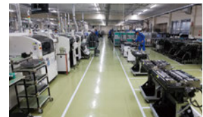
Printed wiring board mounting line (Suzuka Factory)