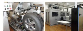
Tire testing machine compatible with WLTP

We hope to grow sales in new fields by providing offerings that combine this testing machine with FA systems.