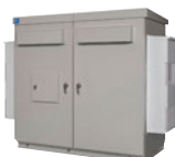
New PCS: PVI1000BJ-3/1000

Fuji Electric will leverage the increased competitiveness of this product to expand its operations in Southeast Asia and other overseas regions.