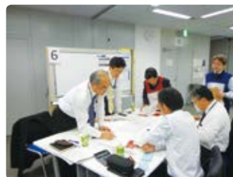
Major disaster simulation drill participated in by officers and subsidiary presidents