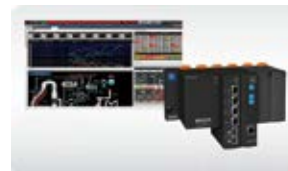
Products comprising fuel-saving boiler combustion solutions (monitoring display and controller)

Fuji Electric's fuel-saving boiler combustion solutions combine laser type carbon monoxide (CO) gas analyzers capable of high-speed measurement of boiler exhaust gas CO process values with ultra low excess air ratio combustion control systems based on CO process values. Boiler combustion control solutions to realize maximum efficiency can contribute to reductions in fuel consumption of approximately 1%.