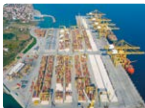
Nine crane control solution sets delivered to Asyaport Liman A.Ş., of Turkey

By combining state-of-the-art sensor and inverter technologies with a programmable logic controller software package, Fuji Electric has developed crane control solutions that realize industry-leading levels of conveyance accuracy through the cooperative control of crane positioning, anti-sway, and anti-skew. These solutions contribute to better automated control for cranes and thereby help realize labor savings.