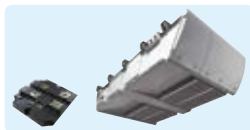
Hybrid module and converter-inverter

The Company succeeded in developing a 3,300V wistand voltage hybrid modules that utilized SiC-SBD and sixth-generation V-Series IGBT modules. In addition, we developed a drive system converter-inverter equipped with this hybrid module for the Central Japan Railway Company. Running tests with this module installed on N700 Series Shinkansen trains are currently under way, representing the world's first practical case of a drive system for a rapid-transit railway using SiC power semiconductor modules.