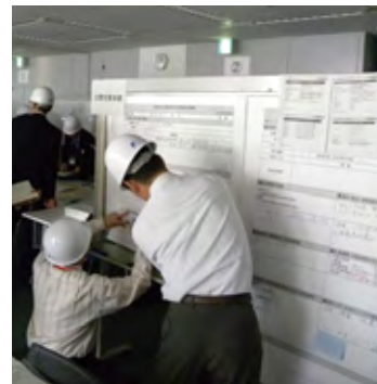
A simulation drill to prepare for a large-scale disaster