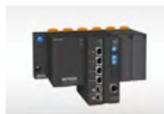
Monitoring control systems