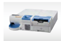
Automatic change dispenser