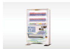
Canned beverage vending machines