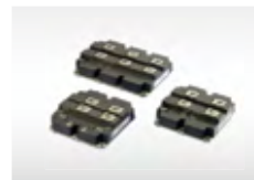
High-power IGBT modules