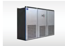
Power conditioning sub-systems