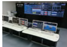
Cluster energy management systems