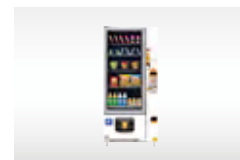
Food and goods vending machines (Chinese and Asian market models)