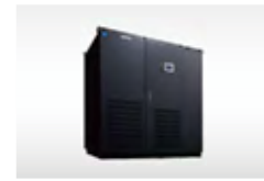
Uninterruptible power systems (UPS)