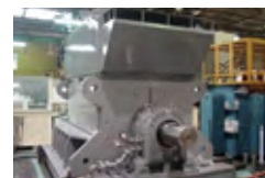
Industrial drive systems