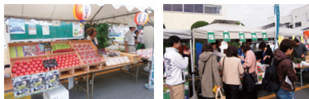
Fresh fruit and vegetables from Fukushima proved extremely popular and sold out repeatedly