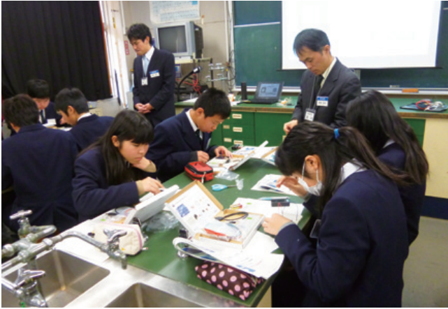
Career education for junior high school students

Using the human resources and technology it has nurtured through its business activities, Fuji Electric works to ensure that as many of its employees as possible are active in communities around the world, with a basic policy of contributing to solutions to the issues those communities face.