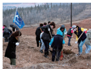
Fuji Electric Dalian tree planting activity

A total of 500 people have taken part over the years in planting around 3,000 seedlings, with vegetation now covering about 30 hectares. Fuji Electric Dalian will continue efforts to increase local greenery.