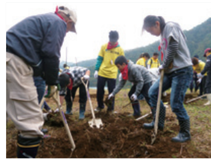
Restoring abandoned agricultural land

in an increase in abandoned farms. In fiscal 2013, 15 children took part in these classes, in which local university students and Fuji Electric employee volunteers assisted, restoring disused land and harvesting traditionally grown vegetables. We hope that such programs can lead the younger generations to understand the need to protect the environment and the importance of food.