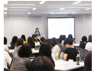
A Role Model Seminar

We have made diversity a top priority in our personnel strategy, aiming to incorporate an array of values and perspectives so we can strengthen our competitiveness and expand business globally. At the same time, we focus on creating work environments suited for globalization, where we respect human rights and prioritize health and safety.