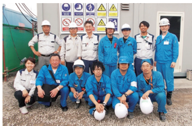
On-site Safety Patrol at a plant construction site in Thailand

In fiscal 2013, we enhanced the health and safety environment in various ways. For example, we had Company-wide safety unit officers instruct on safety at our factories in Malaysia and Thailand and we conducted safety patrols at a plant construction site in Thailand.