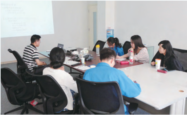
IP training conducted at Fuji Electric (China) Co., Ltd.

In response to the globalization of our business, Fuji Electric, based on respect for both the intellectual property (IP) rights it owns as well as those owned by other companies, is working to implement IP strategies that are aligned with our business and R&D strategies. By advancing these initiatives, Fuji Electric will continue to strengthen and expand its business globally.